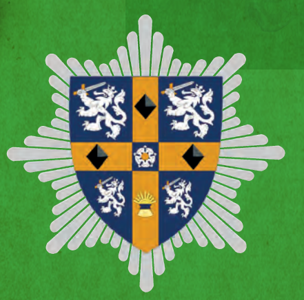
County Durham and Darlington Fire and Rescue Service

Try not to leave extra recycling next to your bin. If possible, store it until the next collection day or take it to the tip on Whessoe Road which is open every day except Christmas Day and New Year's Day (weather permitting). Don't forget to book a slot online before you go www.darlington.gov.uk/tip